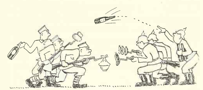
Instead of armaments nations should force their surplus goods on each other.

We shall, of course, observe the rules of war so long as the enemy plays the game; but if the foreigners persist in their refusal to accept our exports, we shall not hesitateto rain British-made goods on undefended cities.